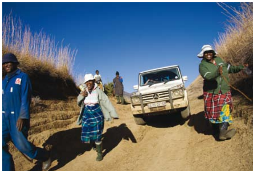
Caption xxx xxxx Caption xxx xxx Caption xxx xxxx Caption xxx xxx.

It took us the best part of the day to do just one of the five trails, but we did take time to interact with the locals. When you take the main roads that connect the well-known lodges or stopovers in Lesotho you tend to miss what travel is really about. The next time I'm in the area I'm definitely going to try another of the Maliba 4x4 trails. Having driven many more formal trails on private property, this one was a breath of fresh air. Yes, it was on public roads, but these roads are so bad that the public does not use them. They're perfect for the guy with a 4x4 that wants to get a feel for the real Lesotho, which you don't get to experience from the main roads.